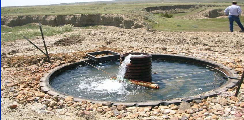
City of Casper wastewater treatment plant